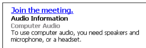
Figure 1. Link for joining the meeting

In the e-mail invitation or the calendar item, click the Join the meeting link, as shown in Figure 1. Microsoft Office Live Meeting automatically opens and joins you to the meeting. If you do not have the client installed on your computer, the invitation will contain instructions on how to install it.